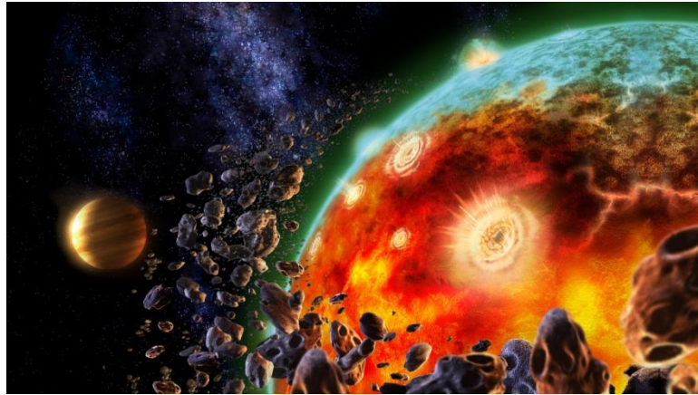
The world will be pummelled into submission!

So the particular Day of the Lord described above is the one that the Church of God normally emphasises.