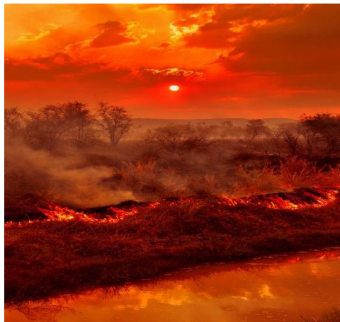
Terrible droughts will encompass the earth

Neither their silver nor their gold shall be able to deliver them in the day of the LORD’s wrath; but the whole land shall be devoured by the fire of his jealousy: for he shall make even a speedy riddance of all them that dwell in the land.” (Zeph 1:14-18)