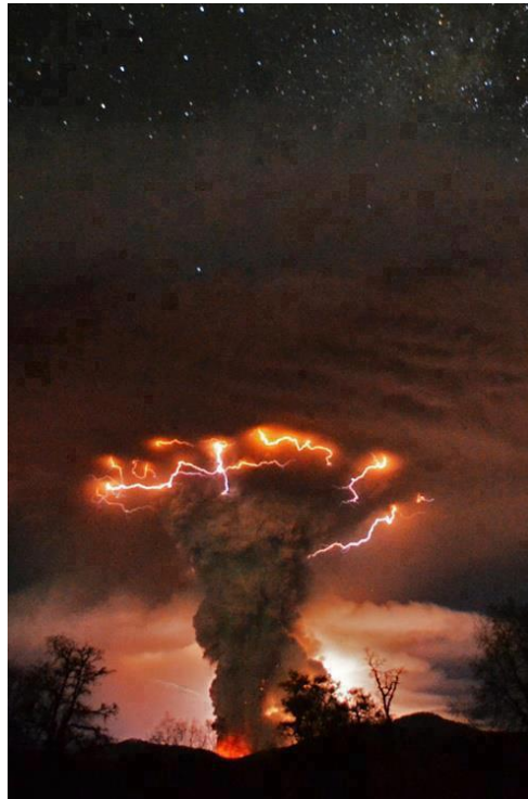
Terrifying and painful judgments are to be poured out on a sinful world

Deuteronomy 28:35, Leviticus 13:18-23 and Exodus 9:9-11 provide further information on boils, use as a tool of punishment by God and the solution providing healing (spiritual and physical).