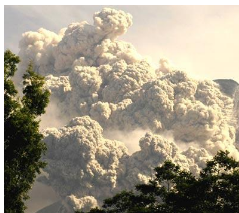
Repent or perish – the Day of the Lord draws nigh!

(refer to Table 1 Comparing the Various Days of the Lord & Related Forces of Destruction which assembles and compares these various Days of the Lord)