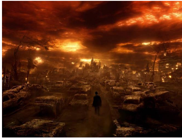
A world devastated waiting for salvation

I will seek that which was lost, and bring again that which was driven away, and will bind up that which was broken, and will strengthen that which was sick: but I will destroy the fat and the strong; I will feed them with judgment.” (Ezek 34:11-16)