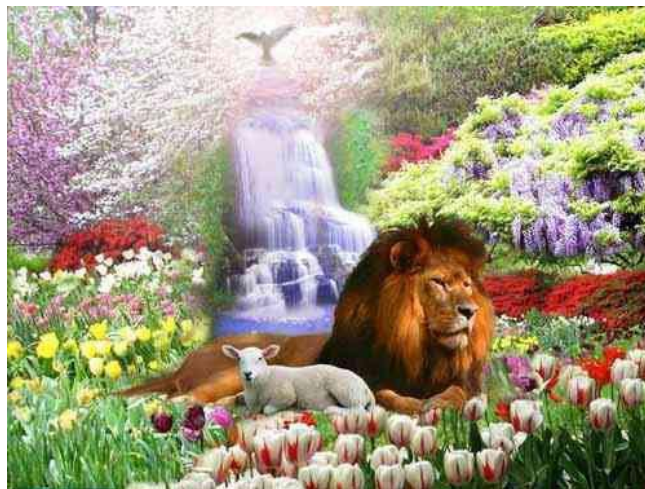
The world at rest and peace during the Millennial Lord's Day

And the LORD shall be king over all the earth: in that day shall there be one LORD, and his name one.” (Zech 14:6-9)