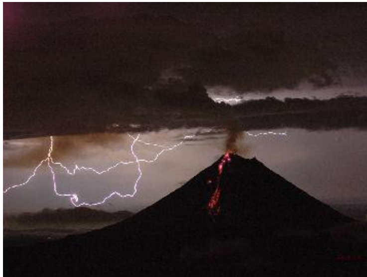
Worldwide destruction awaits the earth!

Sermons similarly explored all aspects of Scripture and were not boring. Today, due to the devastation and consequences of the apostasy of the 1990s, the effects remain in many quarters.